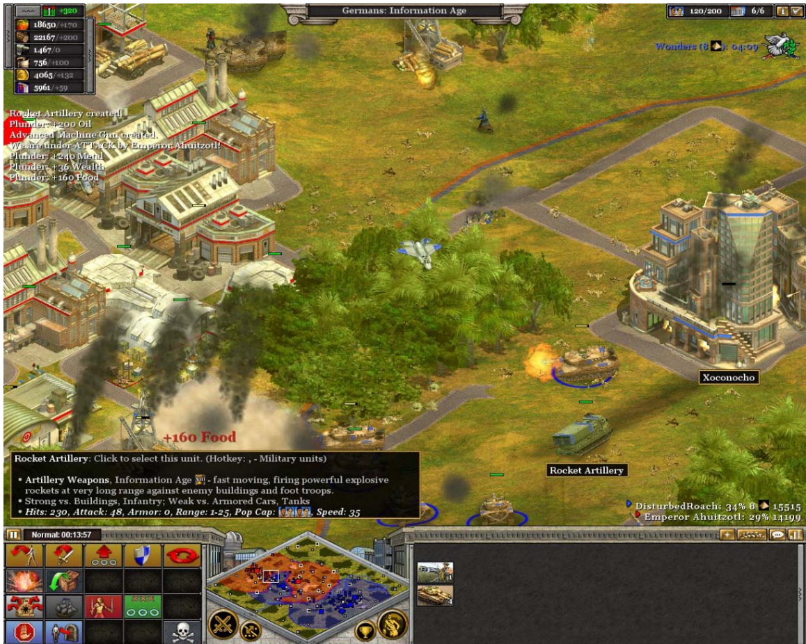
Figure 1 Game Screen